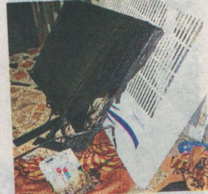
संजय कॉलोनी व सुभाषनगर (नीचे) में शॉर्ट सर्किट से जला सामान।

इससे कमरे में एलईडी, कूलर व अन्य सामान जल गया। कमरे में सो रहे परिवार के लोगों को धुंआ भरने पर पता चला। उन्होंने आग पर काबू पाया। समय पर आग पर काबू पाने से बड़ा टल गया। सुभाषनगर में भी शॉर्ट सर्किट से उपकरण जलने की खबर है।