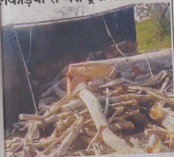
लकड़ियों से भरा ट्रक पलटने से बिखरी लकड़ियां।